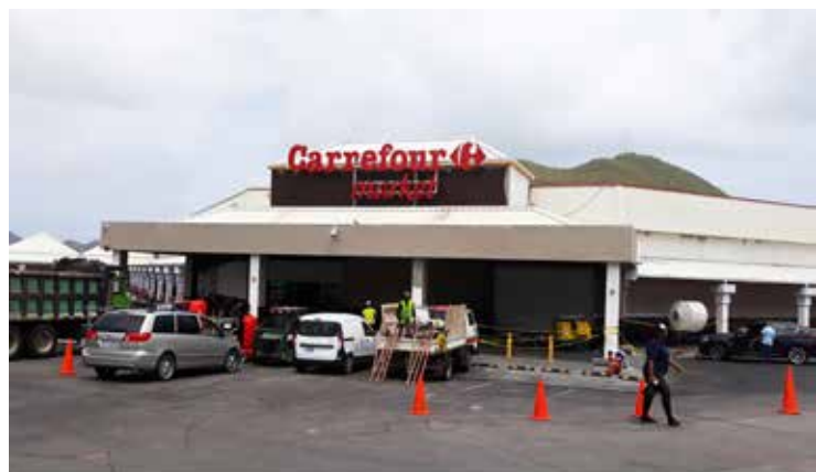
Clean-up crew already hard at work cleaning up the Carrefour Market that was damaged by fire and smoke on Thursday morning.

CUL-DE-SAC -- The exact cause of the fire is yet unknown. To the inexperienced eye, it looks like a bomb exploded inside the former Le Grand Marche supermarket now renamed the Carrefour Market. StMaartenNews.com was invited into the darkened and smoke-damaged supermarket, where some 160 employees were already hard at work cleaning up the place, to take photos. Generators were being used to give the inside